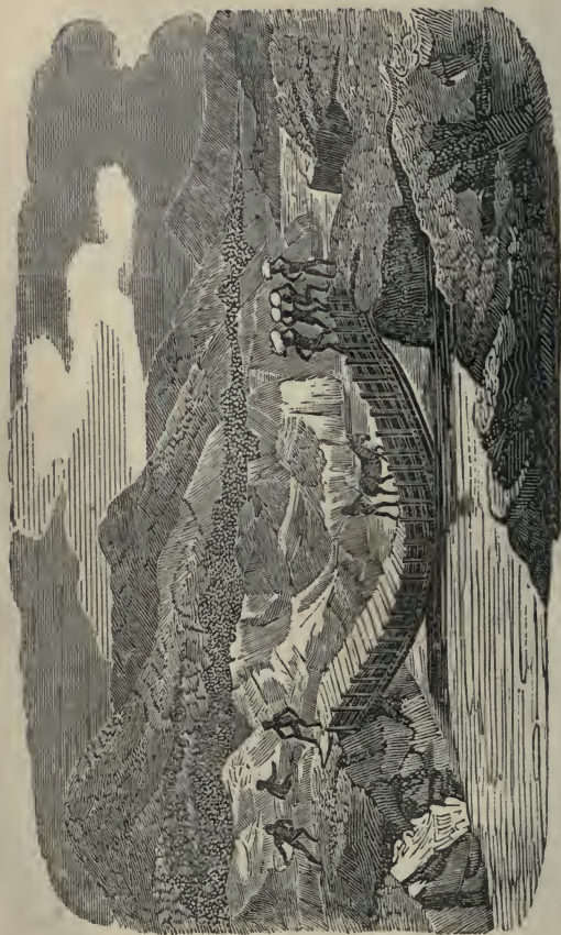
The Floating Bridge on the Black River.